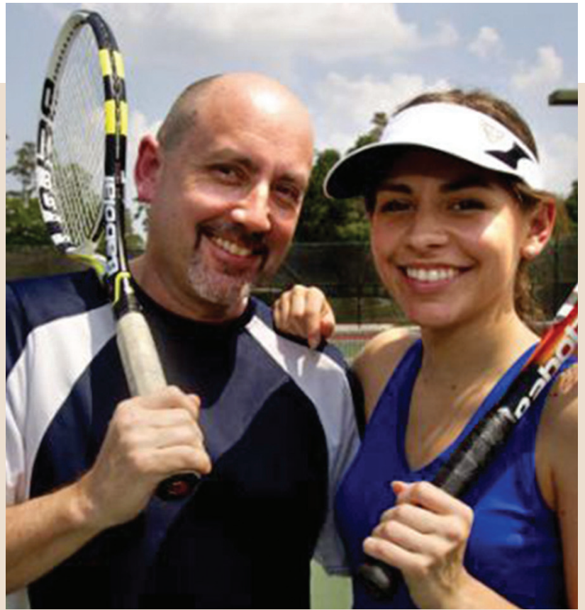
Father and daughter enjoying a game of tennis