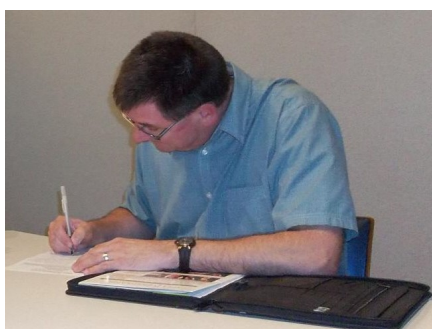
At an Anadarko Petroleum "lunch & learn" event an employee signs up to be a donor.