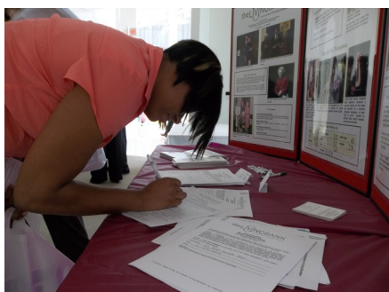
An employee of El Paso Corp completes an organ donor registration form at the company's annual health fair.